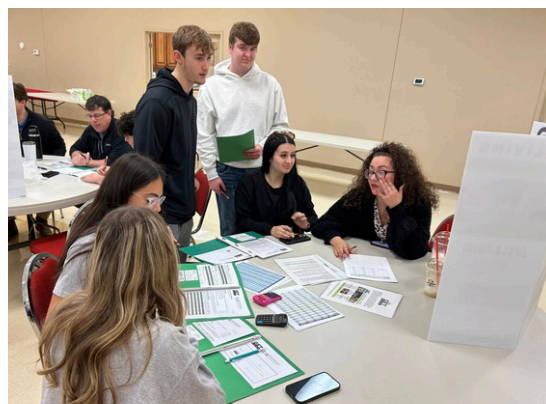
Financial Security for Arkansans program

documented Medicare prescription savings. Tennessee's program resulted in 99% of participants gaining financial knowledge while 56% reported debt reduction resulting in $112 million in economic impact.