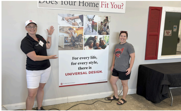
Ohio's Universal Design Program