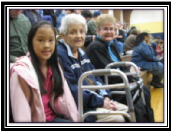
A youth caregiver, a care recipient and a family caregiver.