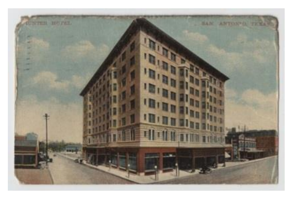
The Gunter Hotel – San Antonio, TX